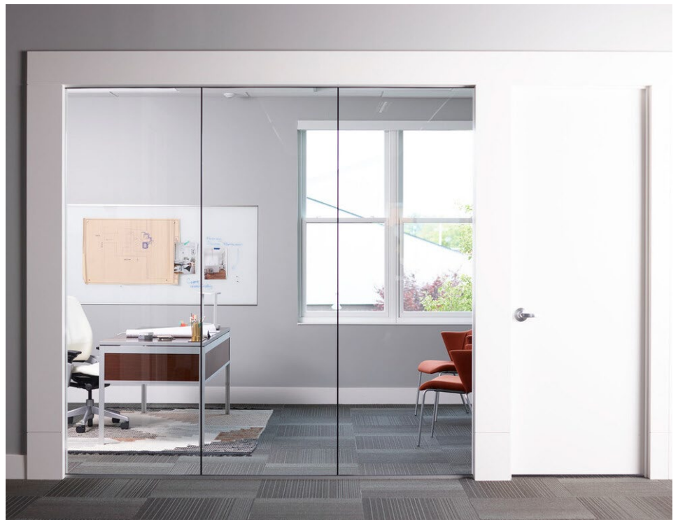
Figure 1 – UltraClear™ Flat Glass

This product-specific EPD was developed based on the Guardian Glass EU Cradle-to-Grave Flat Glass Life Cycle Assessment. The EPD accounts for raw material extraction and processing, transport, and product manufacturing, use, and disposal. Manufacturing data were gathered directly from company personnel. When updated company-specific data were not available the ratio of production units, within the calendar year 2021, was used as a proxy.